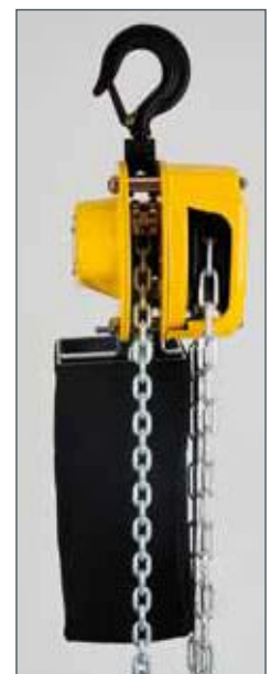
Option: Chain container