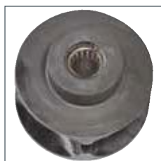
Load chain sheave with needle bearing