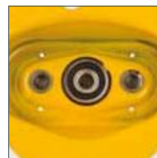
Housing cover with ball bearing